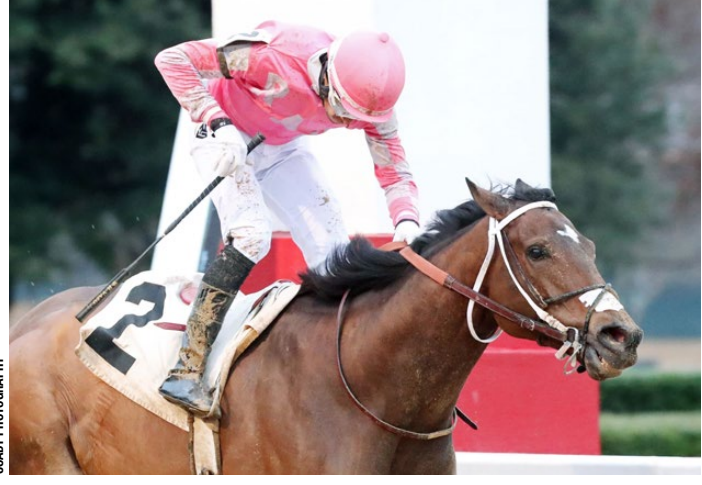
Lone Rock is being pointed to a race at Oaklawn Park before a possible trip overseas for the Dubai World Cup (see page 20 for more)

Knicks Go wins the 2021 Breeders' Cup Classic at Del Mar