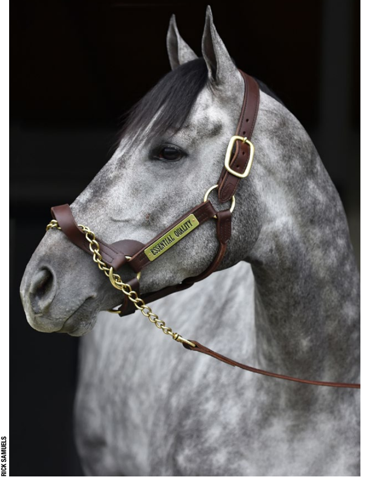
Eclipse Award 3-year-old male finalist Essential Quality at Godolphin at Jonabell, home of the Darley stallions

The Eclipse Awards are sponsored by Roberts Communications, Four Roses Bourbon, Daily