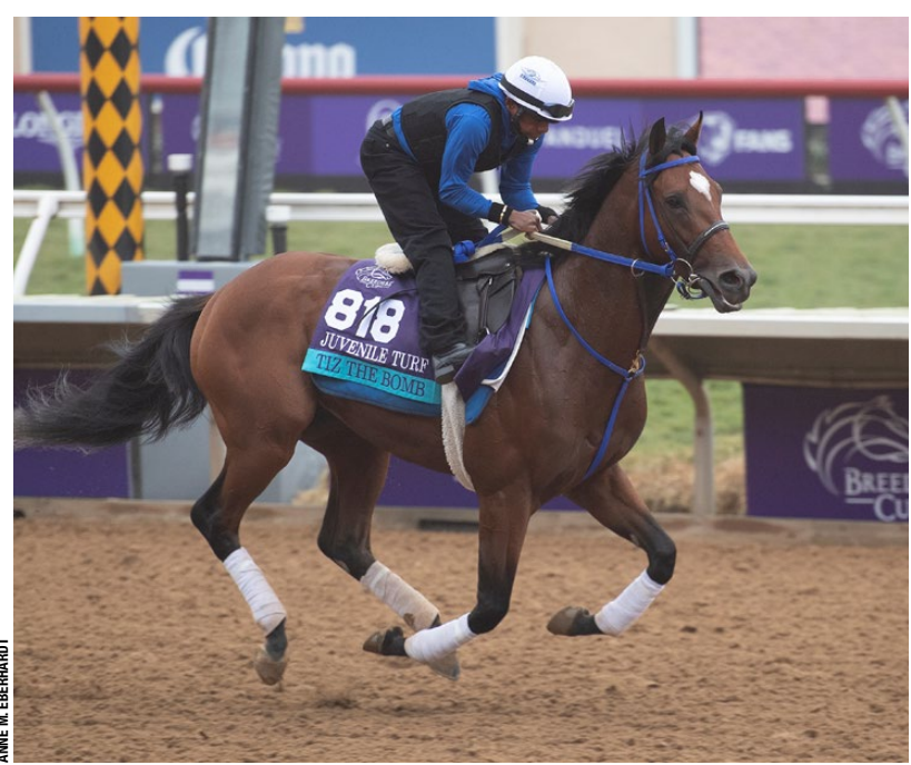
Tiz the Bomb trains at Del Mar ahead of the 2021 Breeders' Cup Juvenile Turf