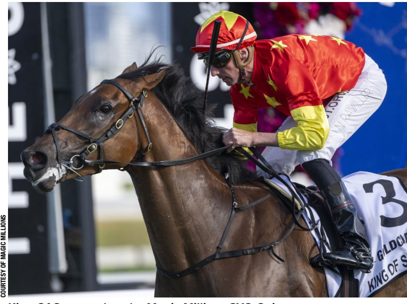
King Of Sparta takes the Magic Millions 3YO Guineas

For more Australia and New Zealand racing, sales, and bloodstock news, visit <u>ANZBloodstockNews.com</u>. BH