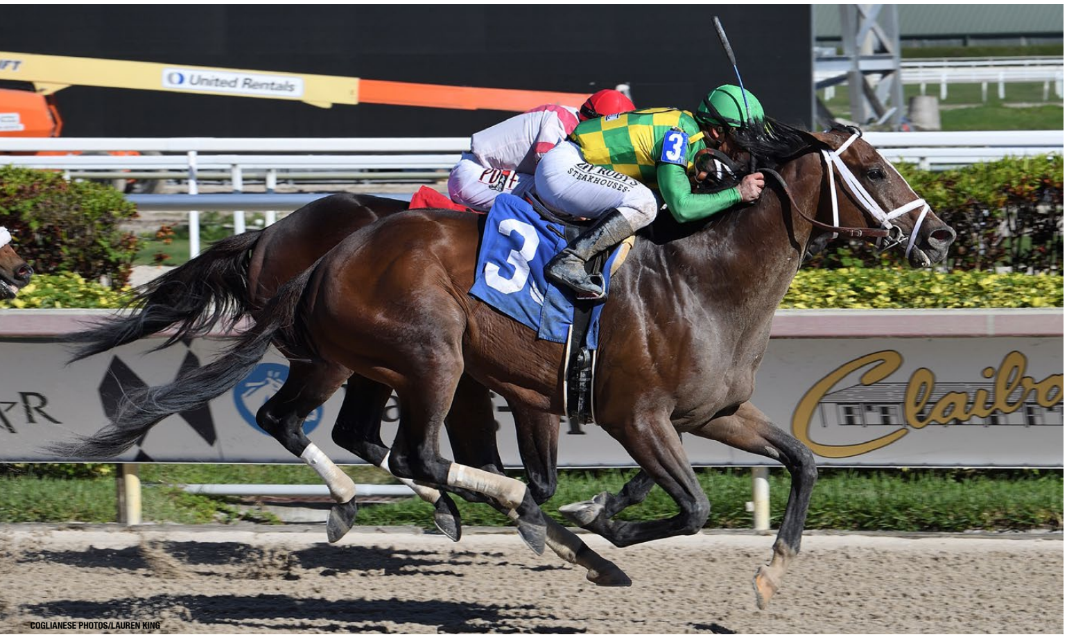
Shamrocket closes past Sir Ollie to win the Sunshine Millions Classic Stakes at Gulfstream Park