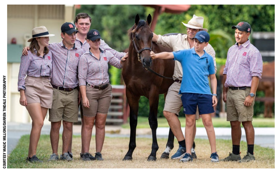
The sale-topping I Am Invincible colt consigned as Lot 585 with the Newgate Farm team at the Magic Millions Gold Coast Yearling Sale

"Whatever way you look at it, it's a record sale, it's a significant sale; it's a benchmark sale of Australasia, if not the world, when it comes to a yearling sale these days and we're thrilled to be able to start 2022 in the manner we have."