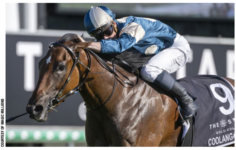
Coolangatta wins the Magic Millions 2YO Classic at Gold Coast

Coolangatta had been the talking horse in the run up to The Star Gold Coast Magic Millions 2YO Classic and Jan. 15 the Ciaron Maher- and David Eustace-trained juvenile lived up to that hype when she produced a brave performance to land the AU$2 million race on the Gold Coast.