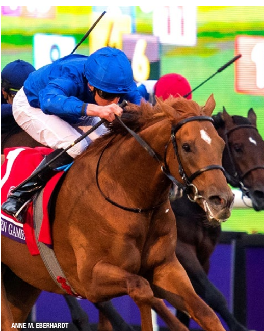
(L-R): Corniche wins the 2021 Breeders' Cup Juvenile at Del Mar; Jack Christopher enters the winner's circle after the 2021 Champagne Stakes at Belmont Park; Modern Games takes the 2021 Breeders' Cup Juvenile Turf at Del Mar