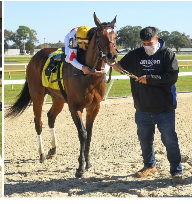
Markhamian wins the Pasco Stakes at Tampa Bay Downs