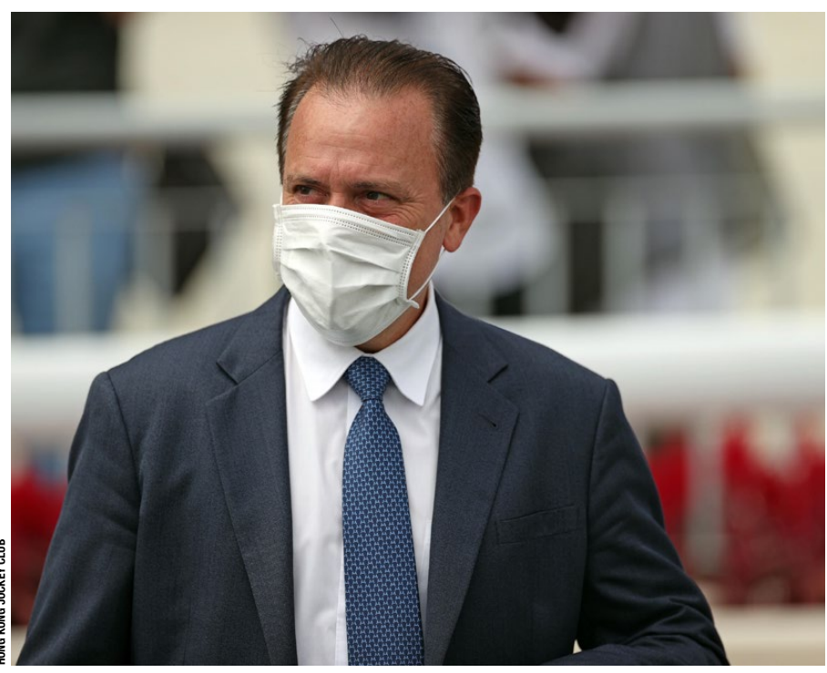
Trainer Caspar Fownes

"I'm seeing the same people every day that I'd see at the races but then I can't go, which doesn't really make sense but it is what it is. I've trained nearly 1,000 winners so I don't care what people think of me."