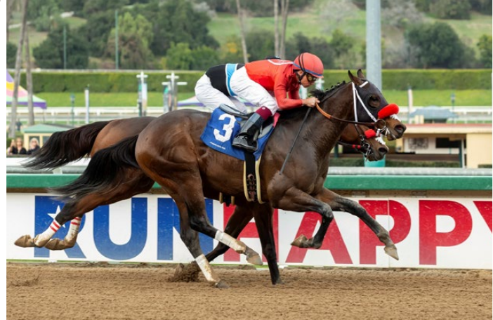
Fast Draw Munnings inches past Straight Up G to win the California Cup Derby at Santa Anita Park

A first-out maiden winner going 5 1/2 furlongs at Los Alamitos Race Course Sept. 17, Fast Draw Munnings was most recently third, beaten 5 1/4 lengths by gate-to-wire winner Straight Up G, in the one-mile King Glorious Stakes against state-breds Dec. 12 at Los Alamitos.