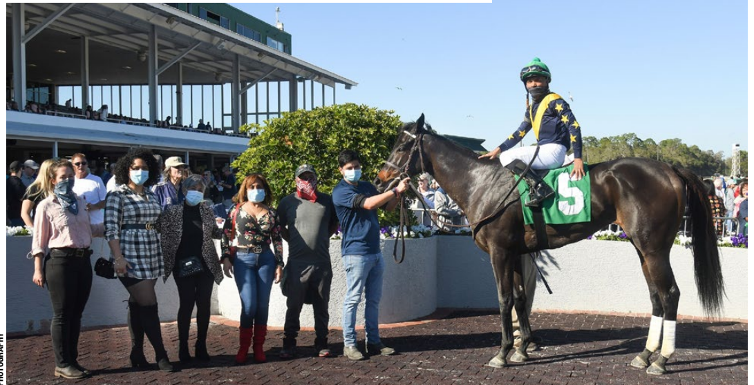
Outfoxed and her connections in the winner's circle after the Gasparilla Stakes

for $27,000 to Jesse Hoppel out of Abbie Road Farm's consignment to the 2020 Ocala Breeders' Sales October Yearling Sale. She was then picked up for $360,000 by the bloodstock agency partnership of Solis/Litt from Hoppel's Coastal Equine consignment to the 2021 OBS Spring Sale of 2-Year-Olds in Training. After four starts, her earnings stand at $477,000. BH