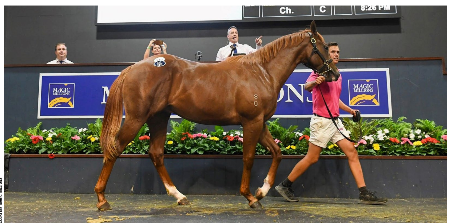
The Exceed And Excel colt consigned as Lot 910 in the ring

For more Australia and New Zealand racing, sales, and bloodstock news, visit ANZBloodstockNews.com. BH