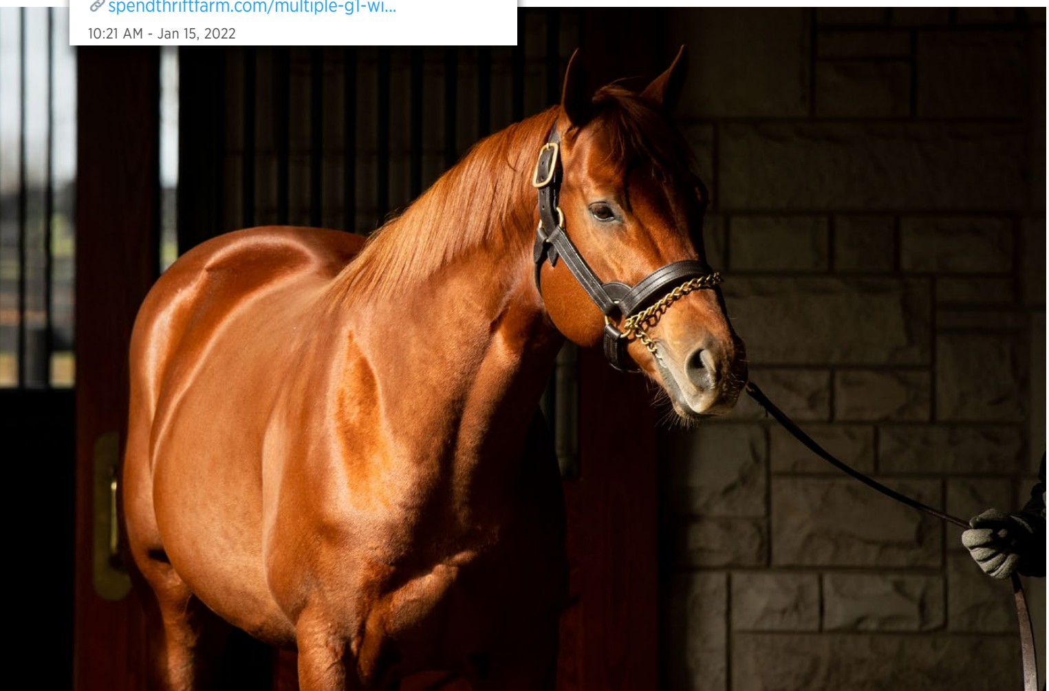
Vekoma at Spendthrift Farm