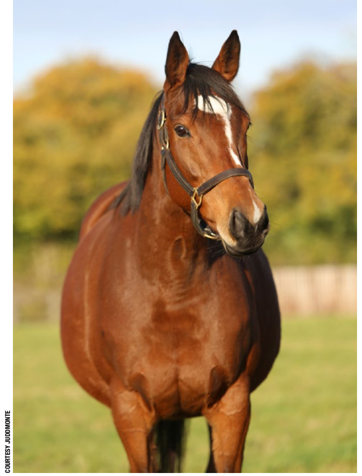
Enable in her paddock at Banstead Manor Stud