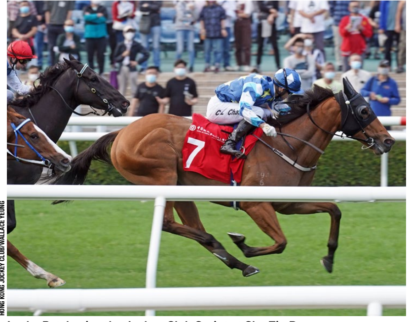
Lucky Patch wins the Jockey Club Sprint at Sha Tin Racecourse

The results of the Jockey Club Cup are hard to evaluate as some runners were auditioning for the Cup at the same distance on the December program while others were prepping for the Vase.