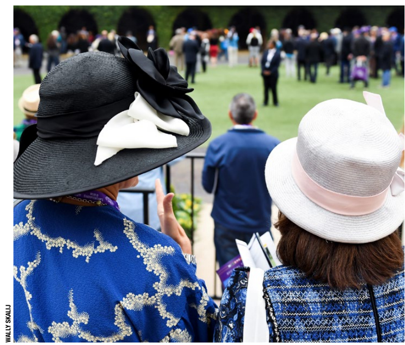
Fans observe the paddock for the Breeders' Cup at Del Mar

Every day should be Lover's Day (April 23), Taco Day (Oct. 4), or Miniature Golf Day (Sept. 21). There's never enough. And how could anyone have a problem with Random Act of Kindness Day (Feb. 17), Public Sleeping Day (Feb. 28), or Chocolate Cupcake Day (Oct. 18)?