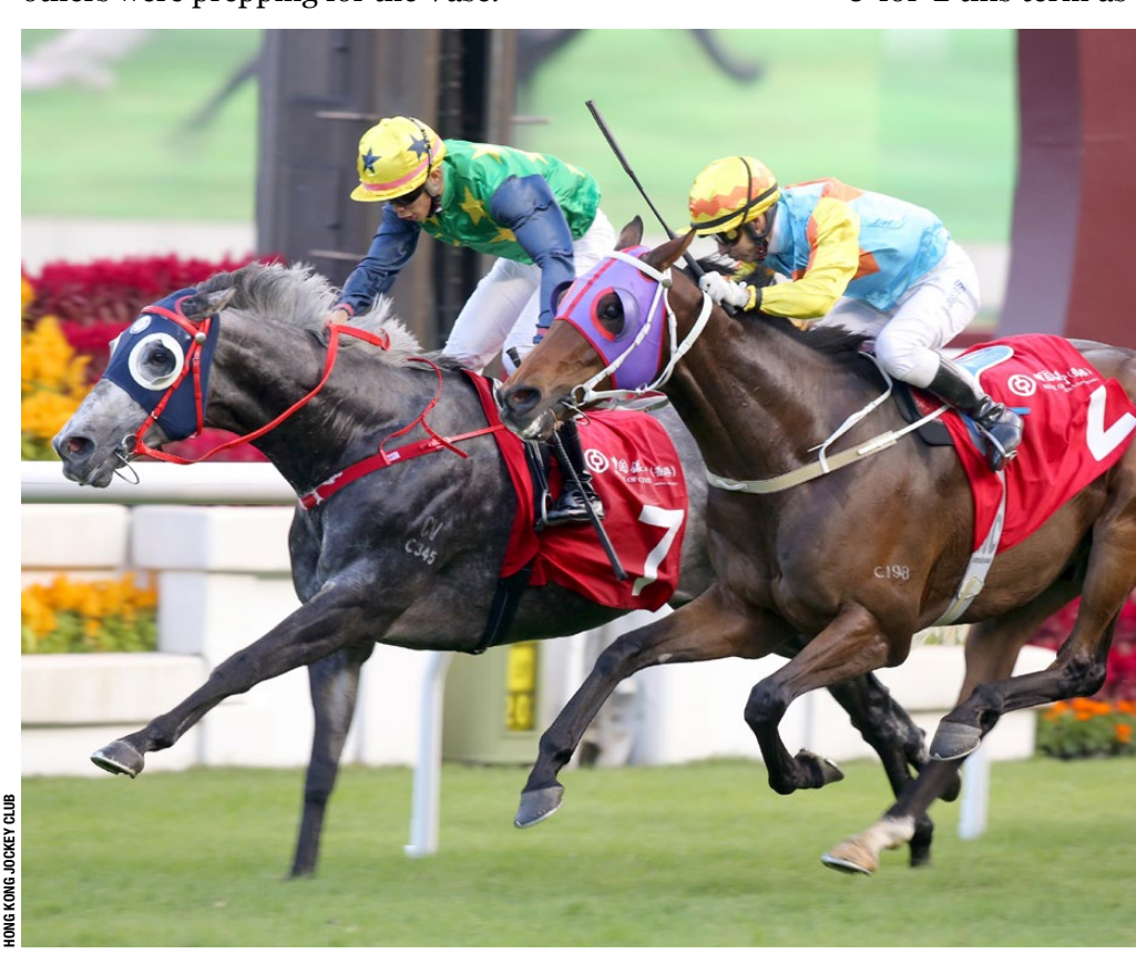
Reliable Team (left) holds off Ka Ying Star in the Jockey Club Cup