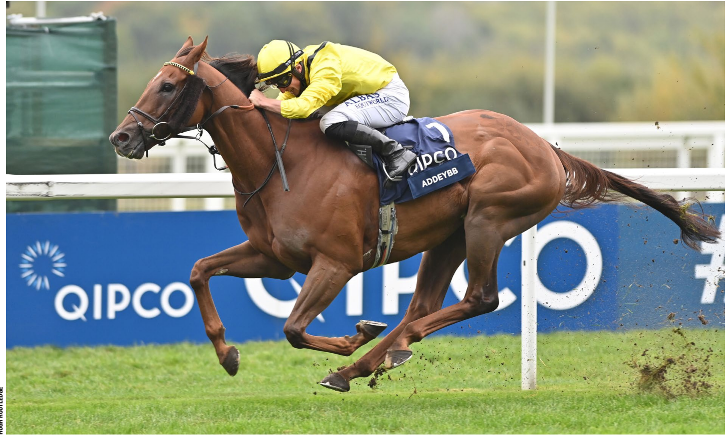
Addeybb wins the 2020 Champion Stakes at Ascot Racecourse