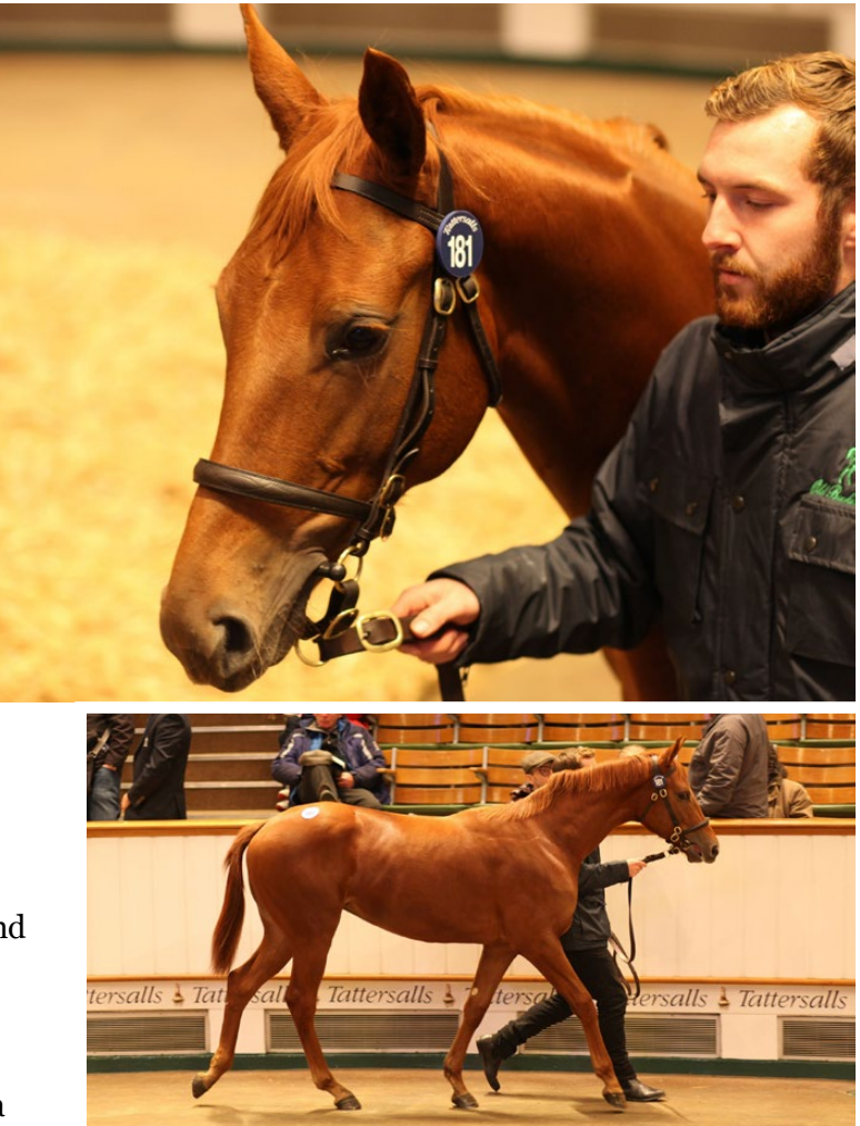
Sea of Class in the ring at the 2016 Tattersalls December Yearling Sale

The sale also features another significant consignment from Shadwell Estates, which is set to offload 14 quality yearlings.