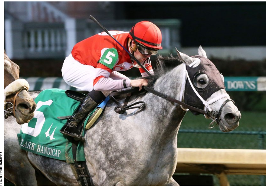
Leofric wins the 2018 Clark Handicap at Churchill Downs

The handsome gray broke his maiden as a 4-yearold at Oaklawn Park and added two allowance victories