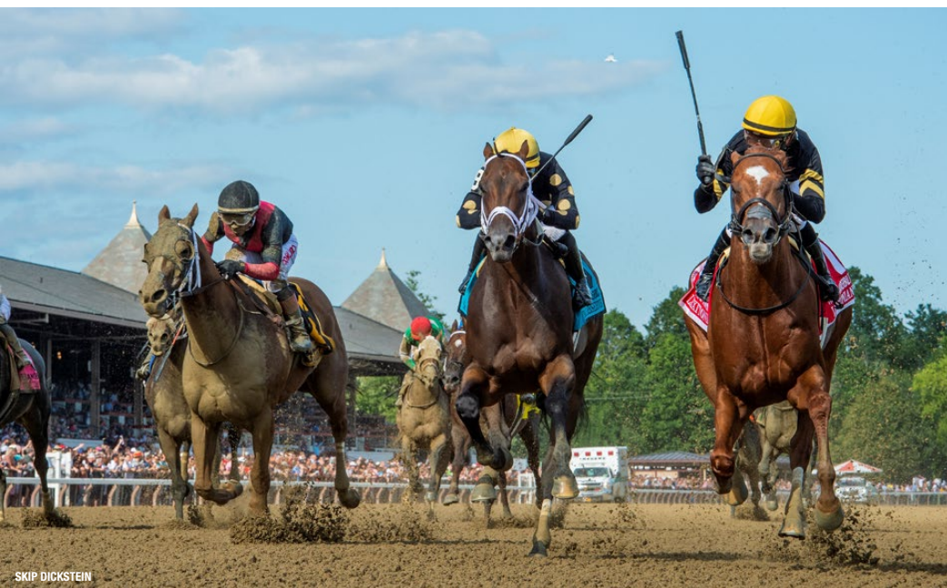
Lexingtonian (inside) leads the charge to the wire in the Vanderbilt