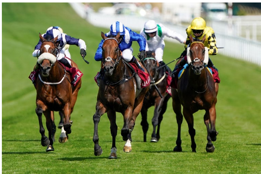
Battaash wins the 2020 King George Stakes at Goodwood Racecourse