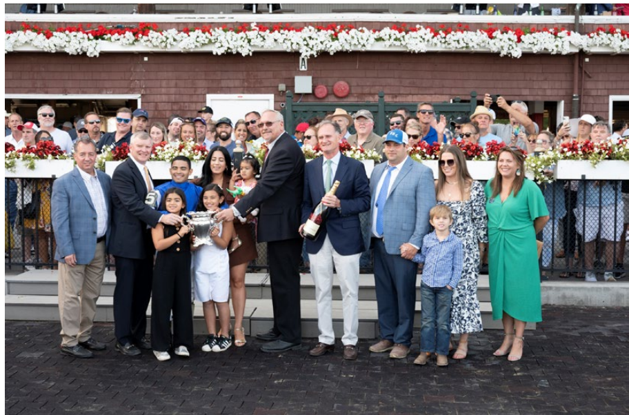
Essential Quality's connections enjoy the Jim Dandy trophy presentation