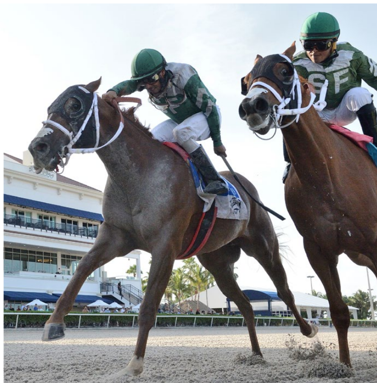
Cajun's Magic edges stablemate Dean Delivers in the FTBOA Florida Sire Dr. Fager Stakes at Gulfstream Park