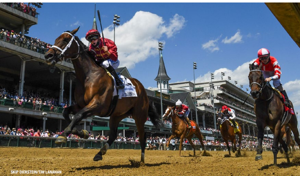
Shedaresthedevil wins the La Troienne Stakes at Churchill Downs