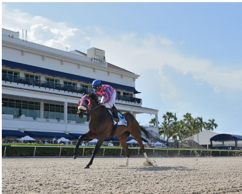
My Sassenach cruises in the FTBOA Florida Sire Desert Vixen Stakes at Gulfstream Park

She is the first winner for her dam, the winning Utopia mare Cynthia's Fury. The dam's other foals are a First Dude yearling filly and Bucchero colt foaled this year. BH