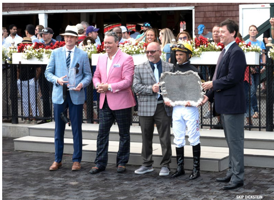
The connections of Lexingtonian gather in the winner's circle at Saratoga