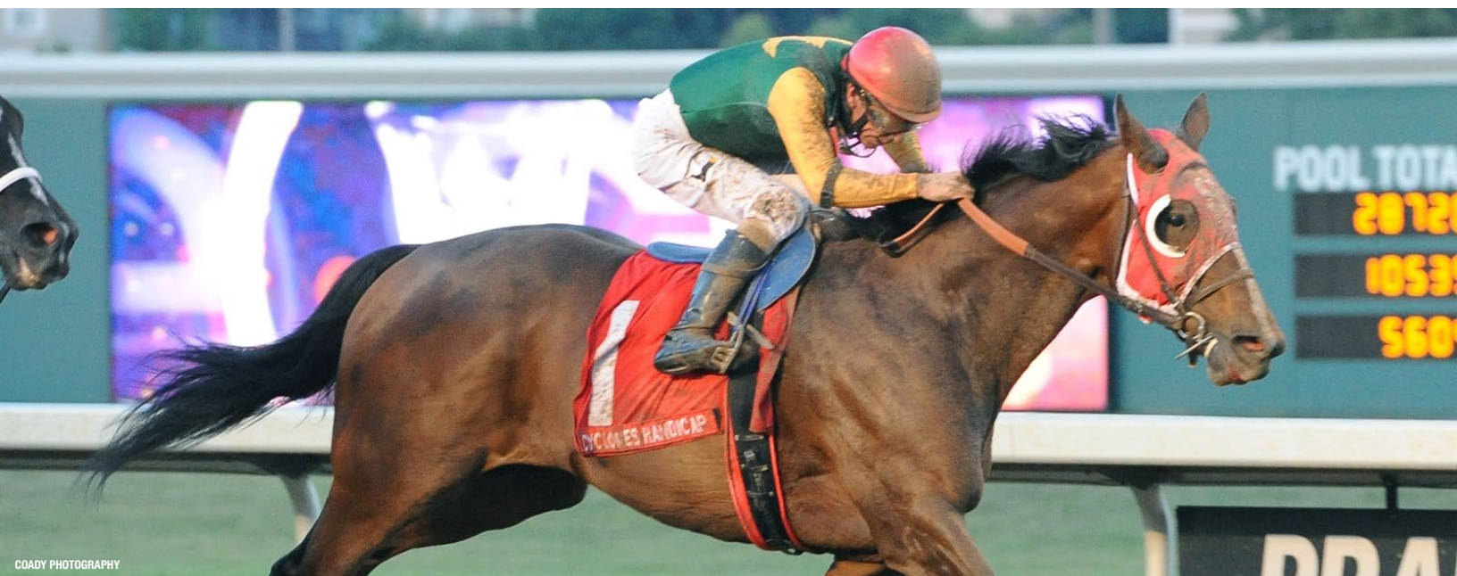
Net Gain wins the 2019 Cyclones Handicap at Prairie Meadows