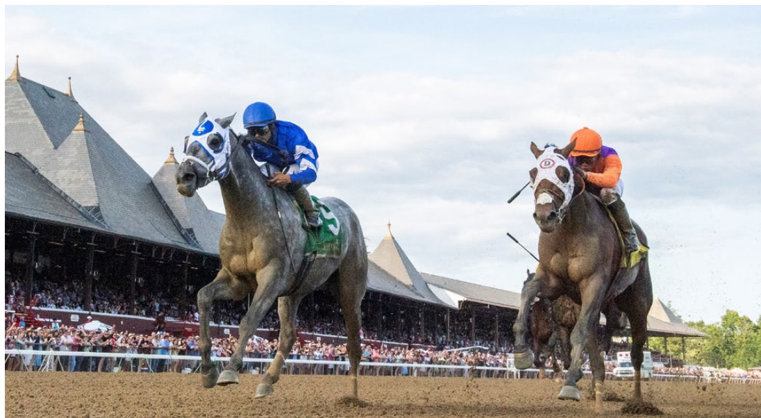
Essential Quality turns back Keepmeinmind to win the Jim Dandy Stakes at Saratoga

champion a year ago and is a favorite to add another title this year.