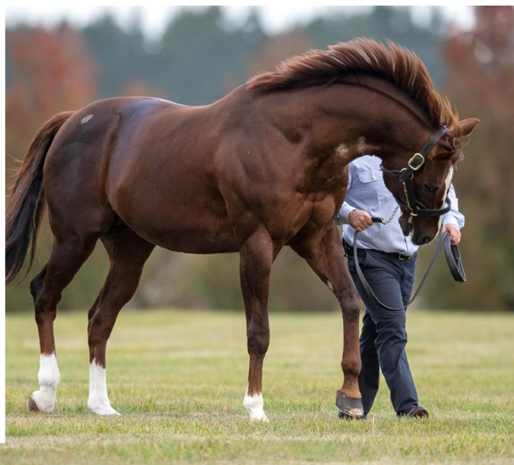
Written Tycoon at Woodside Park Stud