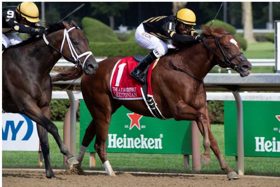
Lexingtonian wins the Alfred G. Vanderbilt Handicap at Saratoga Race Course