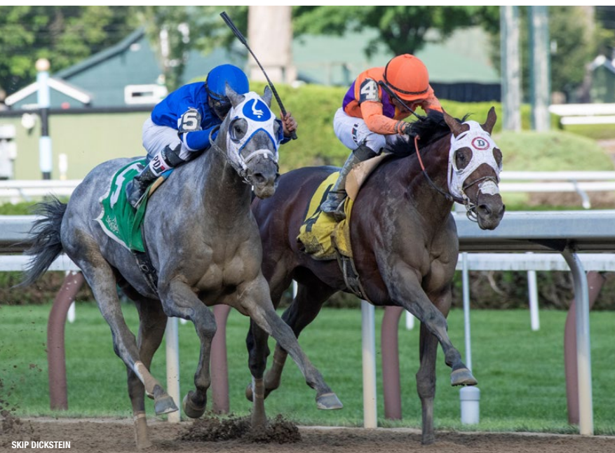
Essential Quality and Keepmeinmind stride toward the wire