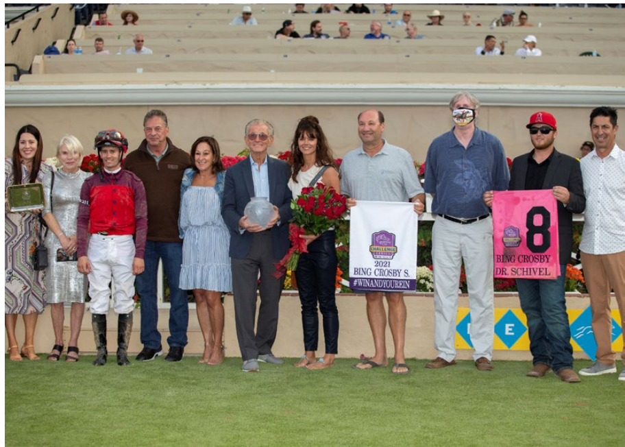
Dr. Schivel's connections enjoy the Bing Crosby trophy presentation