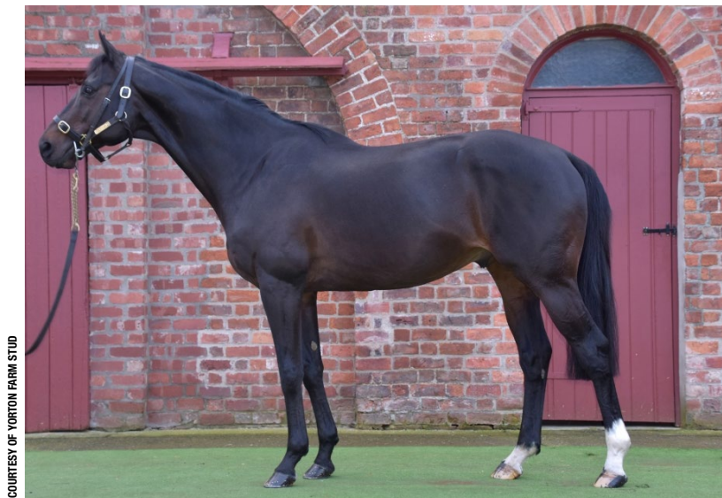
Arrigo at Yorton Farm Stud