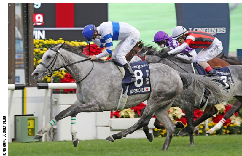
Normcore wins the Hong Kong Cup at Sha Tin Racecourse