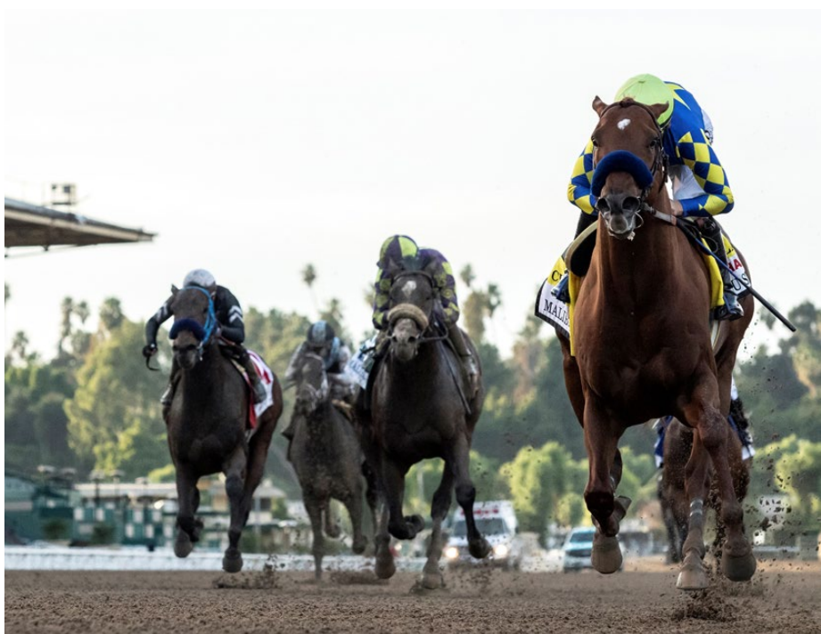
Bettors helped Santa Anita Park to a record opening day on a card that saw Charlatan deliver a dominating performance in the Malibu Stakes