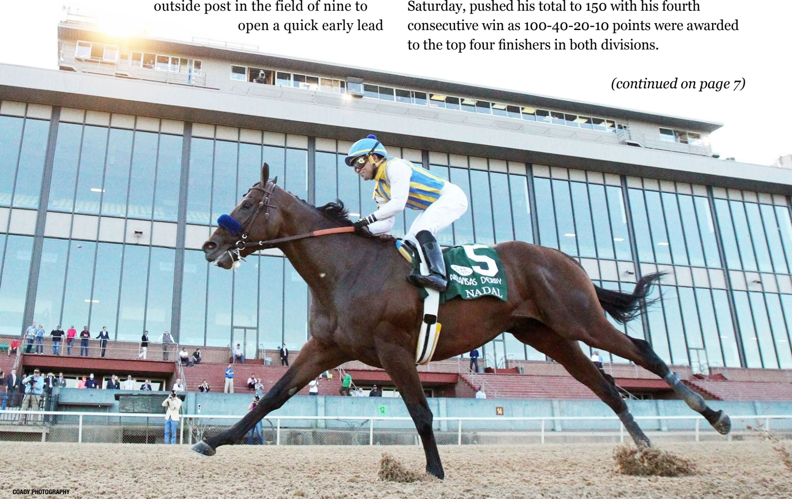
Nadal strides out to win the second division of the Arkansas Derby