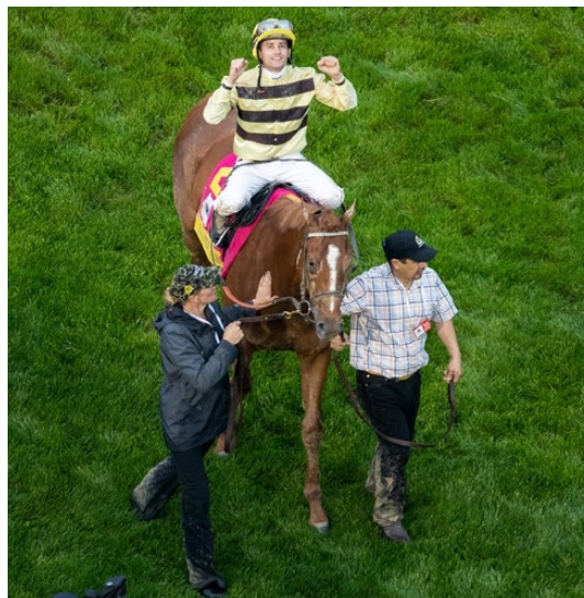
SUNDAY, MAY 3, 2020