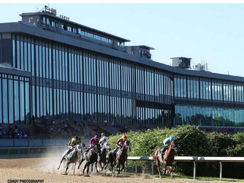
Charlatan shows the way in the first division of the Arkansas Derby

Charlatan has earned $367,200 from his three victories. BH