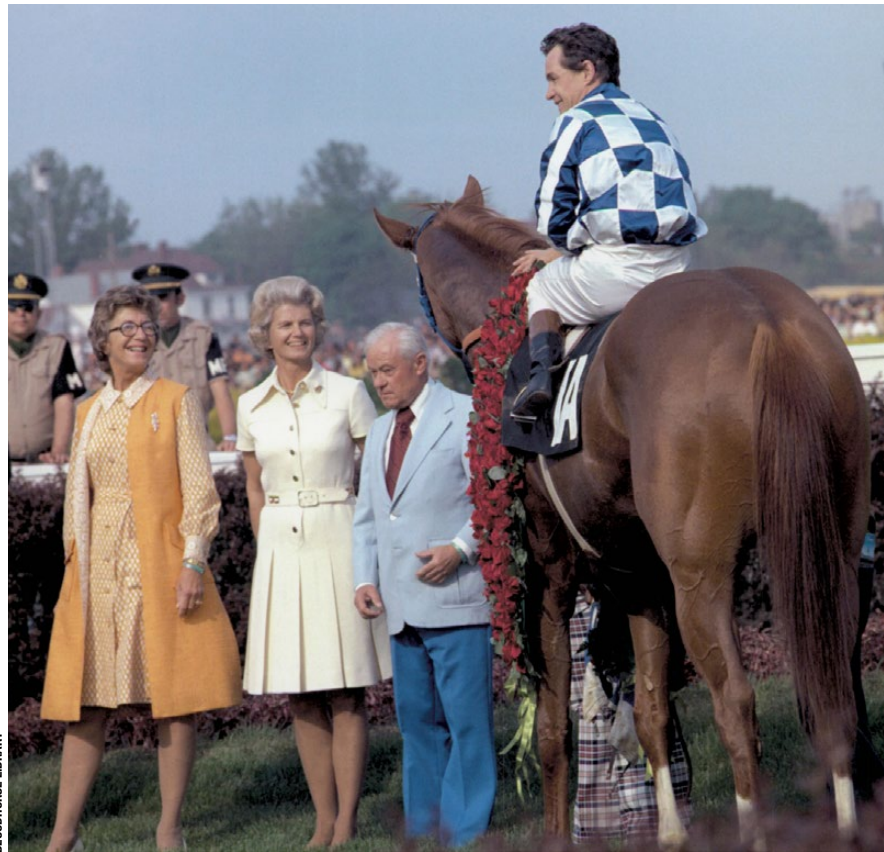
Secretariat wears the garland of roses after winning the 1973 Kentucky Derby at Churchill Downs

Secretariat, who stalked the pace for much of the race, proved best in the stretch, clearly in no need of his customary blinkers in the virtual world. Churchill Downs said a limited time frame for production didn't allow the graphics to incorporate equipment such as blinkers.