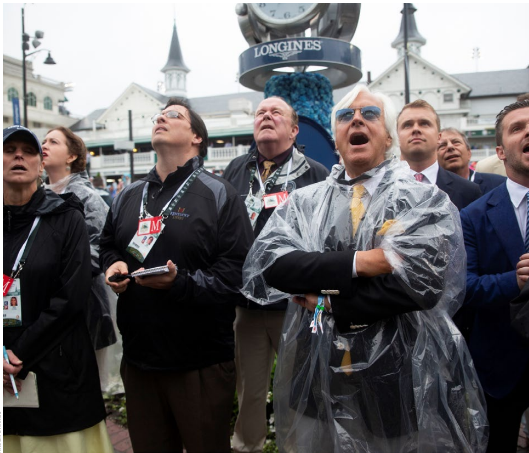
Bob Baffert (sunglasses) will have key contenders to cheer for in the Sept. 5 Kentucky Derby, but will need to determine a path to Churchill Downs during a season like none before

While the Arkansas Derby victories provided Nadal and Charlatan with more than enough qualifying points, Baffert's horses,