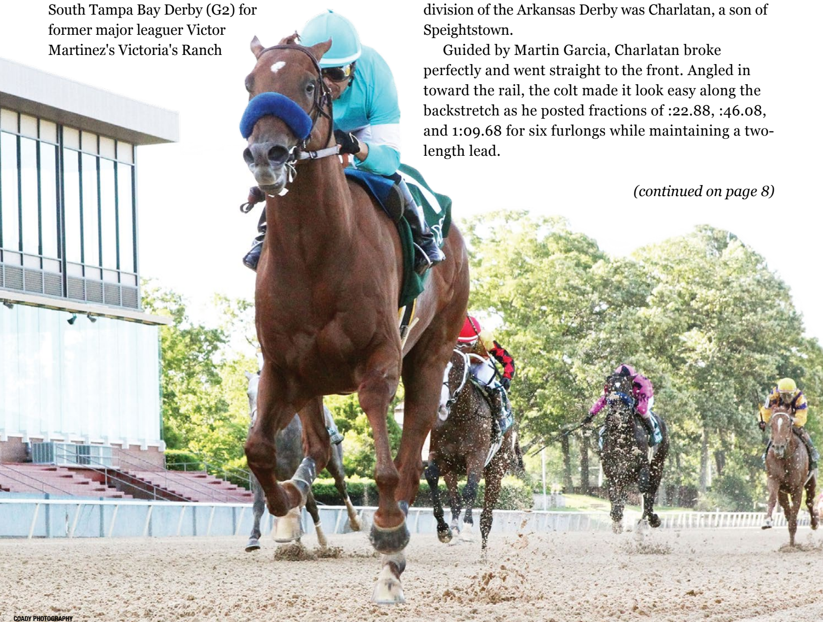
Charlatan gallops away from the field in the first Arkansas Derby division