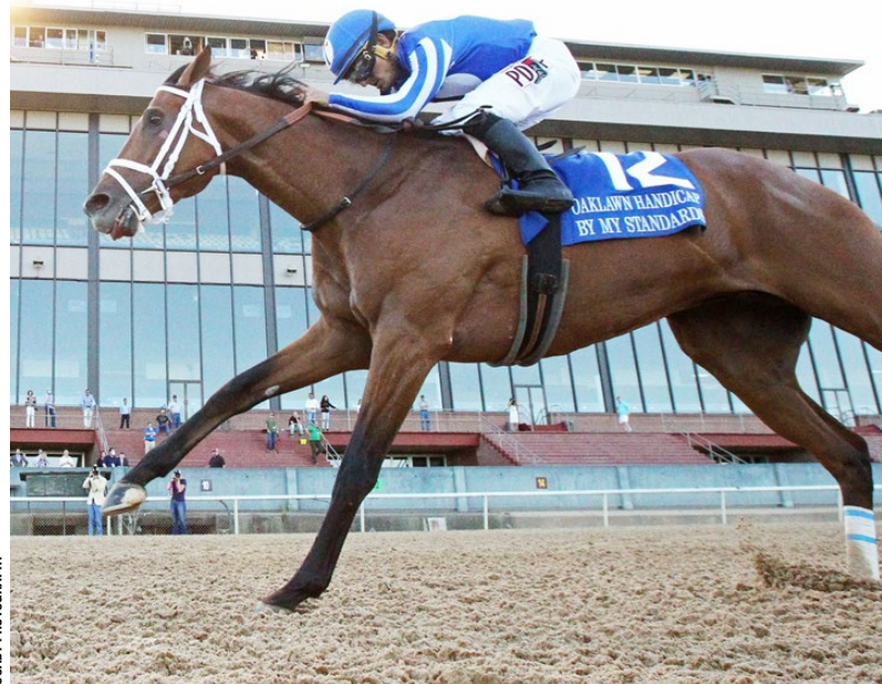
By My Standards wins the Oaklawn Handicap at Oaklawn Park