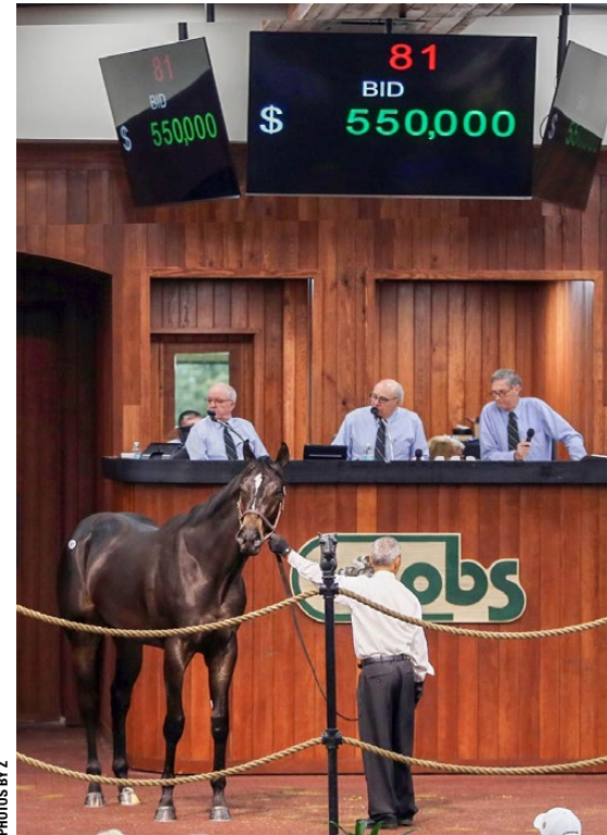
Schrodinger sells as Hip 81 during the OBS March 2-Year-Olds in Training Sale