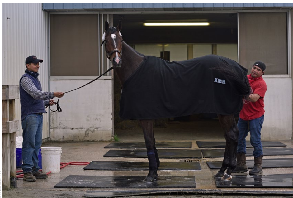
Alwaysmining gets a bath after training May 13