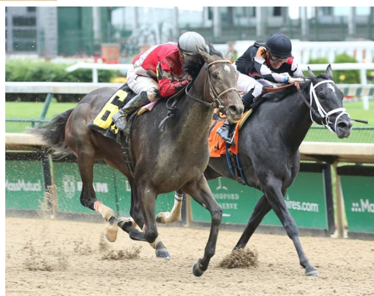
With Dignity (outside), a half sister to McCracken, wins her debut by a half-length at Churchill Downs