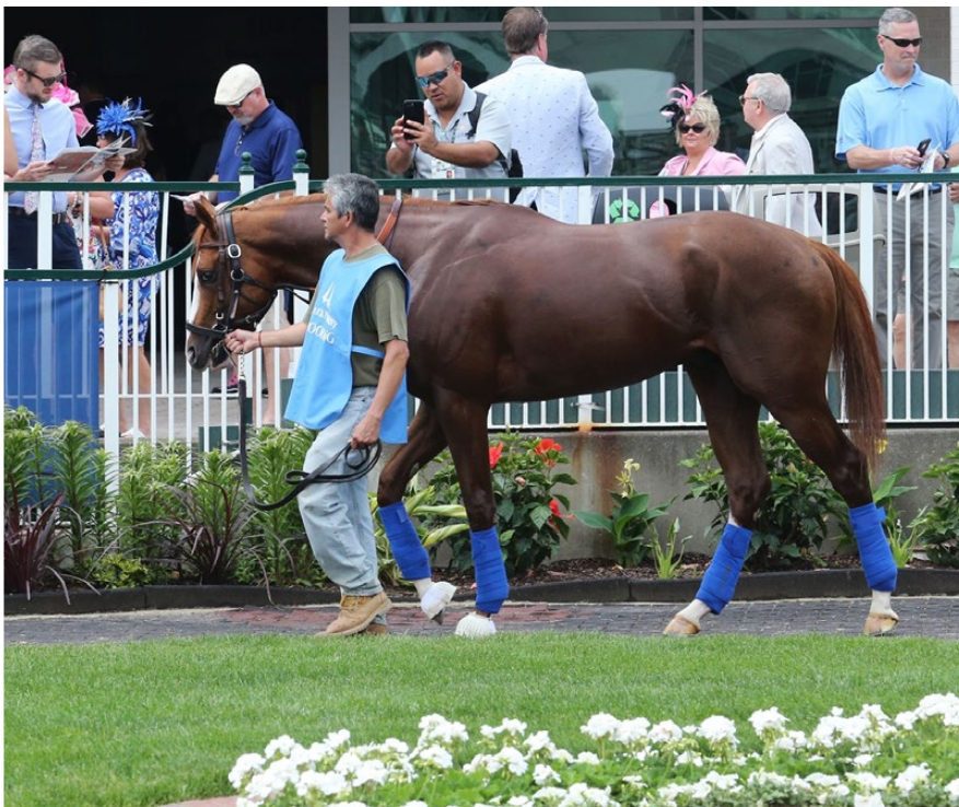
Improbable schools at Churchill Downs

running). We want to go up there and make sure he's hitting on all cylinders. We don't want to go up there and embarrass ourselves. So we were looking good today."