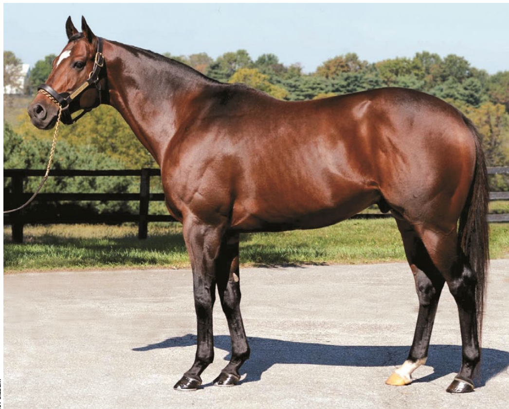
Country Day at Crestwood Farm

Out of the grade 3-winning Mt. Livermore mare Hidden Assets, Country Day is a half