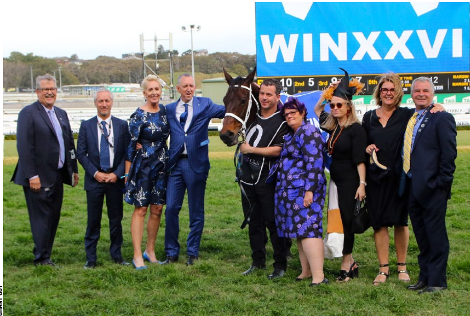
Winx with her connections after the Aug. 18 Winx Stakes at Royal Randwick

"This is not about me—it's about the amazing Winx. What she's done for the sport in Australia is incredible. She never looks like she's dominant in her races, but when it comes to the pressure point, she just breaks their hearts, as they can't live with her.