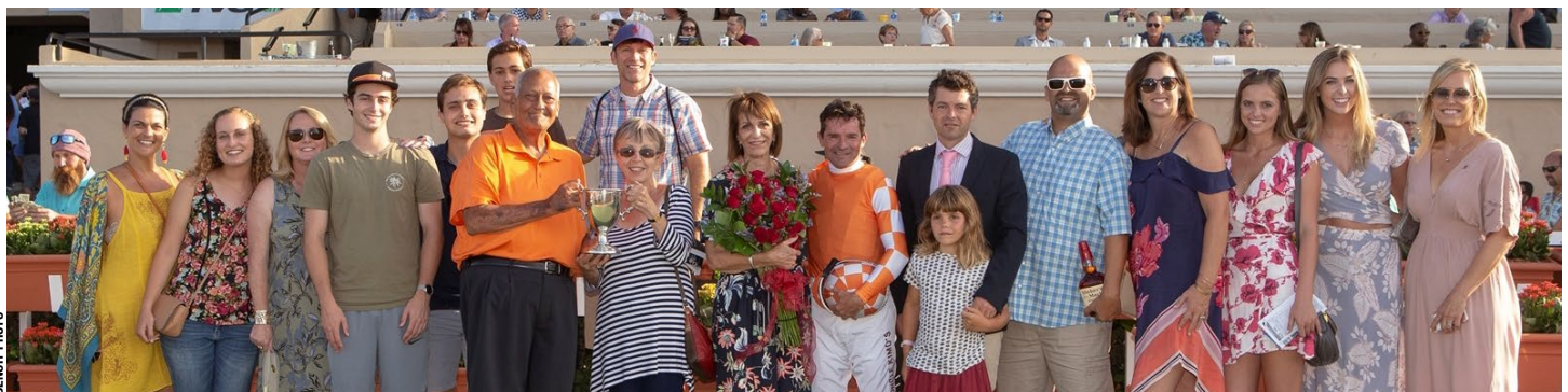
Fatale Bere's connections after the Del Mar Oaks