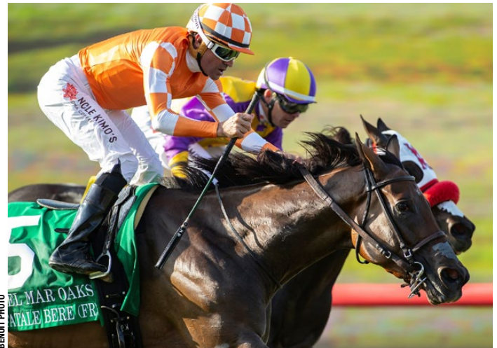
Fatale Bere (outside) wins the Del Mar Oaks

That put Ollie's Candy and Ms Bad Behavior, who were in a stalking position, into a duel to the wire. Ollie's Candy put away Ms Bad Behavior, who