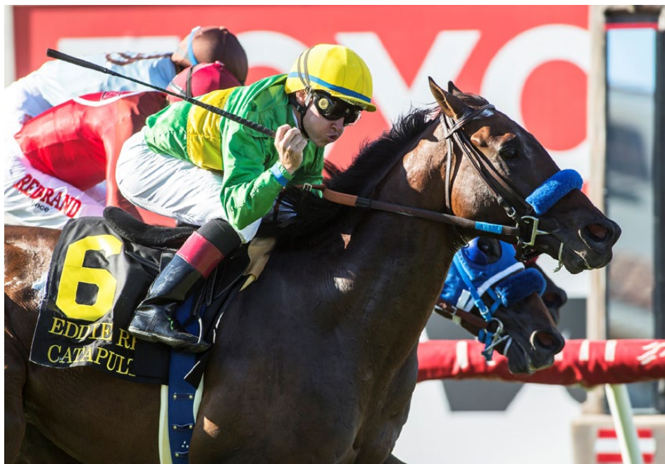
Catapult wins the Eddie Read Stakes at Del Mar