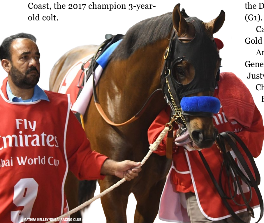
West Coast, out of champion Caressing, has put Honour and Glory among the top 12 leading North American broodmare sires this year

Caressing did not lose any momentum as a broodmare, positioned now as Honour and Glory's most successful daughter by progeny earnings. Out of the Majestic Prince stakes winner Lovin Touch, the handsome dark bay mare is the dam of West Coast, the 2017 champion 3-year-old colt.