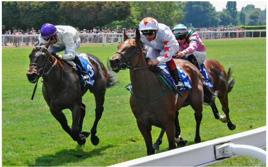
Phoenix Thoroughbreds and Zen Racing's Signora Cabello (Inside) wins the Prix Robert Papin by a neck at Maisons-Laffitte in France