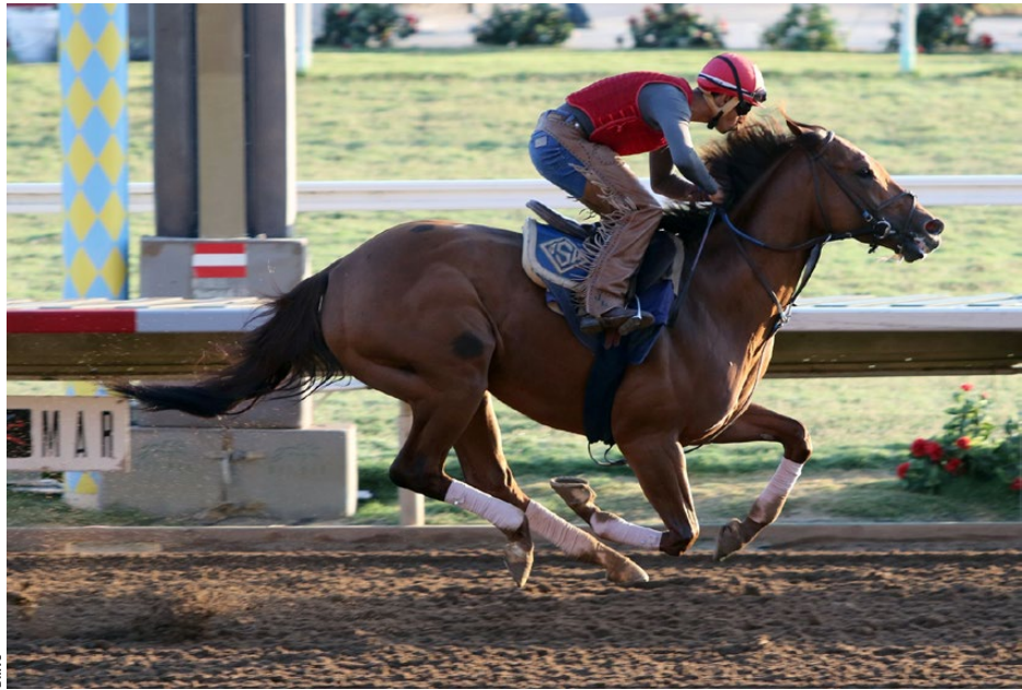
Accelerate works five furlongs in :59 3/5 at Del Mar