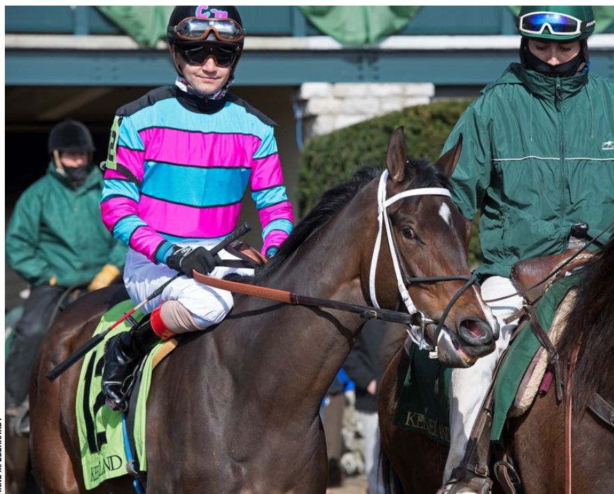
Finley'sluckycharm prior to her Madison Stakes score at Keeneland

Unfortunately for her connections, one of those off-the-board outings came in her most recent effort. After a brilliant run in the Madison Stakes where she prevailed by a nose after pressing American Gal through wicked early fractions of :21.96 and :44.31, Finley'sluckycharm finished