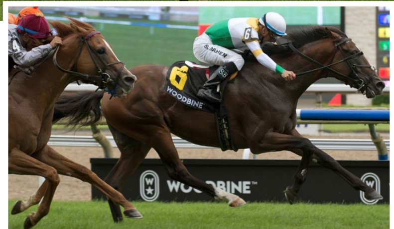
Tiz a Slam wins the Nijinsky Stakes at Woodbine

just getting bigger and stronger, and maybe he just keeps getting better, also."