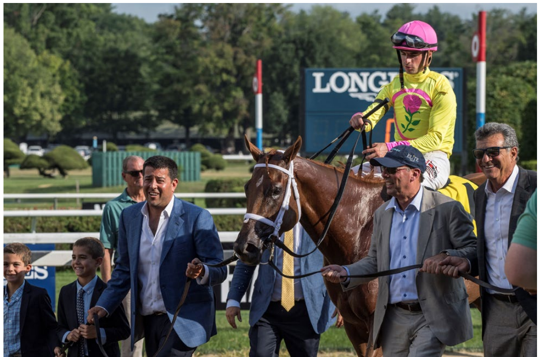
Monomoy Girl is led to the winner's circle by her connections after the Coaching Club American Oaks at Saratoga Race Course