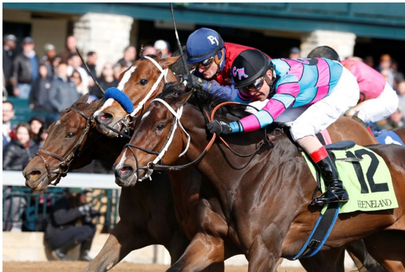
Finley'sluckycharm (inside) wins the Madison Stakes