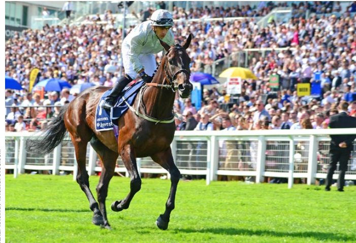
Dee Ex Bee finished second in the Investec Derby

Saxon Warrior is a top-priced 8-11 shot with Paddy Power, while Dee Ex Bee is freely available at odds of 4-1.