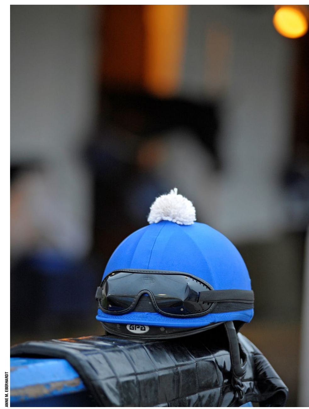
A jockey's helmet, goggles, and protective vest

With the new vest weighing between 0.4lb and 0.6lb more than the Level 1 vest, the allowance for jockeys safety equipment at the scales will be raised to 3lb (from 2lb) from Oct. 1.