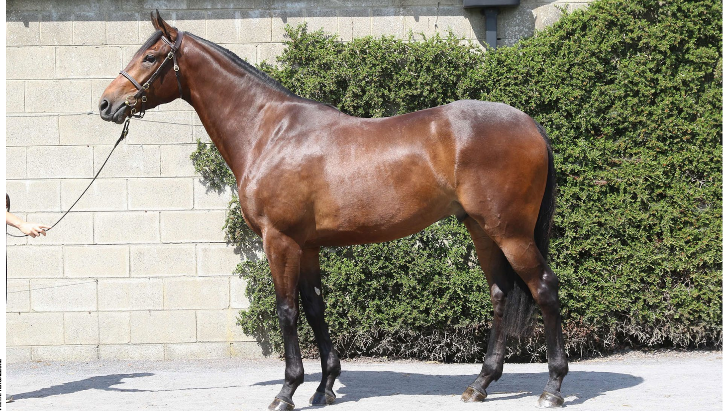
A half brother to Altior consigned as Lot 462 set a Tattersalls Ireland Derby sale record

"From the outset of the sale on Wednesday morning right through to the fall of the hammer this evening, the insatiable demand for horses has resulted in the highest aggregate of €17,890,500 and joint highest average of €51,654 ever recorded at the sale since its inception in 1975, and this rapacious appetite which was observed over the last two days for quality National Hunt potential again truly underscores the Derby sale's position as the undisputed venue of choice for selling select stores." BH