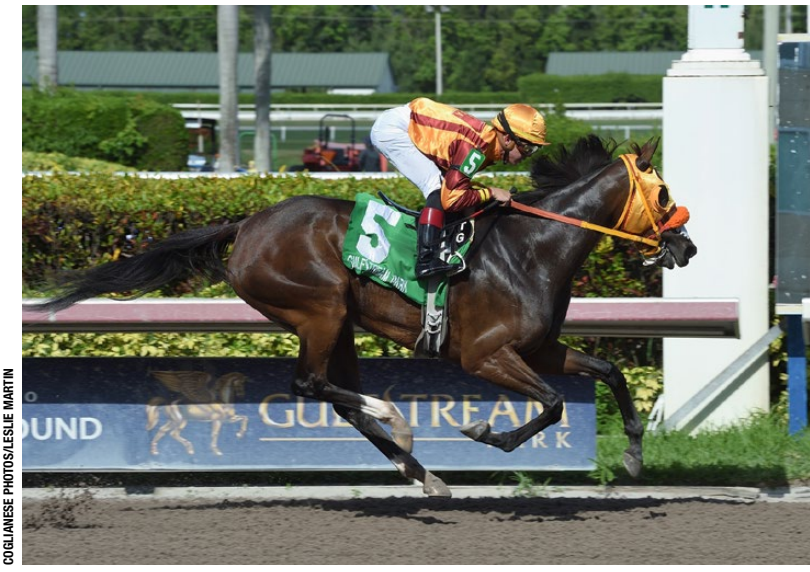
Curlin's Approval wins the Ana T. Stakes at Gulfstream Park

The 4-year-old daughter of Dialed In won her fourth straight race in the Fritchie before tasting defeat in the