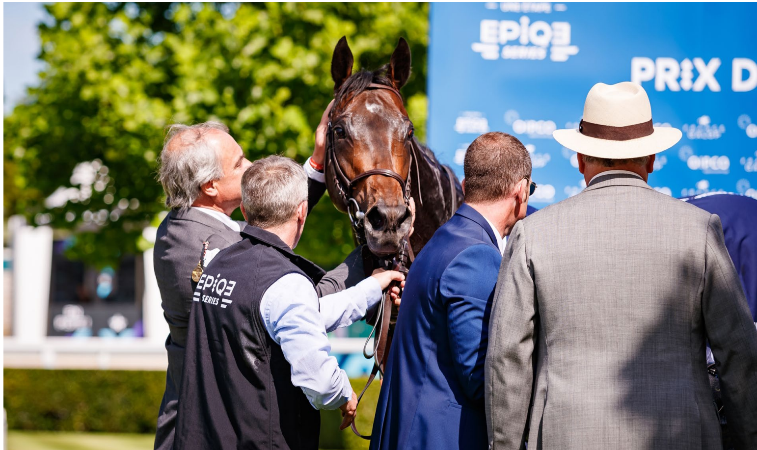
Study of Man is tended to by his connections after winning the Prix du Jockey Club at Chantilly