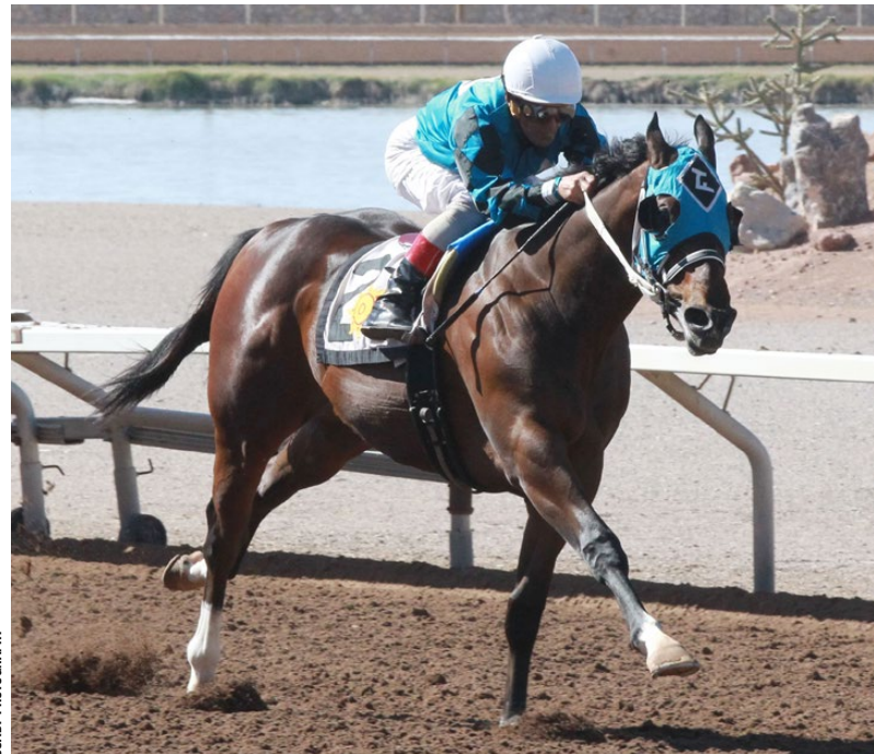
Hustle Up, a gelded son of Abstraction, wins the Copper Top Futurity at Sunland Park to bring his record to 2-for-2