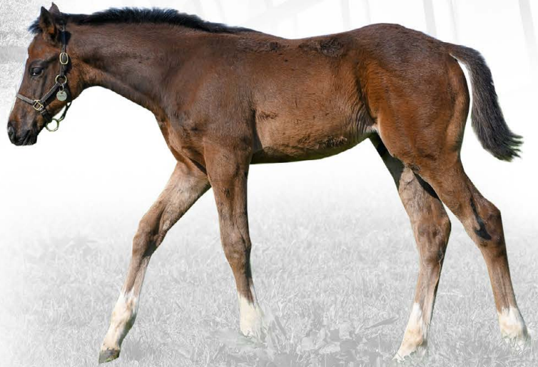
Colt o/o Ventoux, bred by Cerca Trova