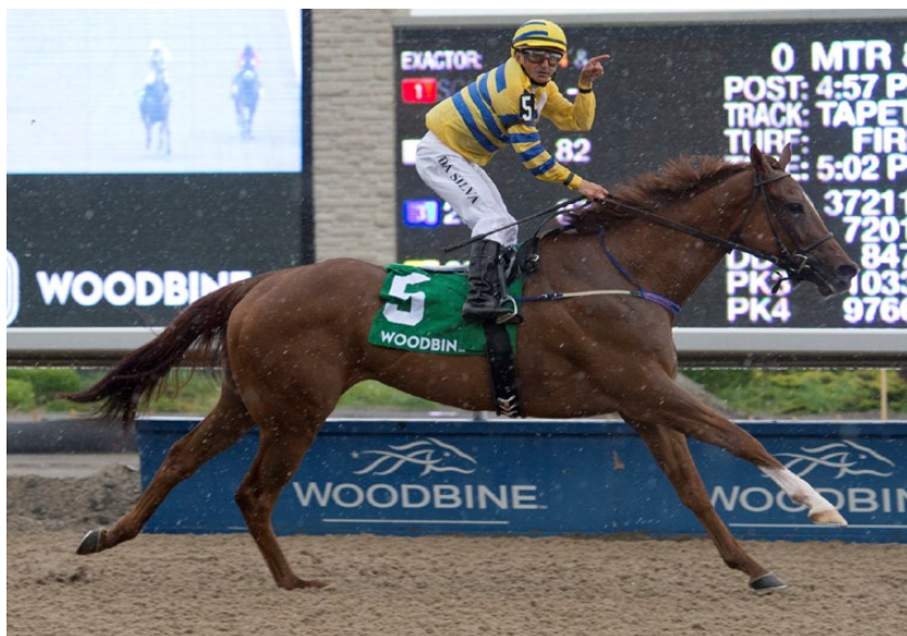
Pink Lloyd wins the Achievement Stakes at Woodbine