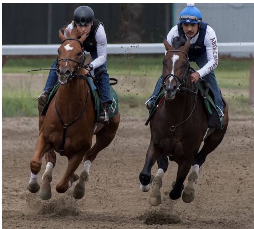
Hofburg (outside) works with Good Samaritan June 3 on the Oklahoma training track at Saratoga Race Course

A Juddmonte Farms homebred, Hofburg broke his maiden in March at Gulfstream Park in his second start before finishing second to Audible in the Xpressbet.com Florida Derby (G1). The son of Tapit finished seventh—8 3/4 lengths behind Justify—in the Kentucky Derby Presented by Woodford Reserve (G1)