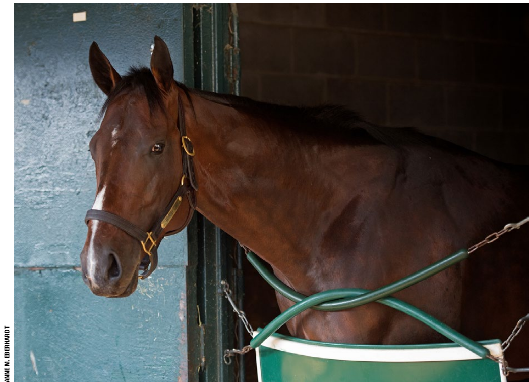
Bolt d'Oro in his stall at Keeneland

Sunday's workout was the final drill for the bay colt before he ships to New York for the $1.2 million Runhappy Metropolitan Handicap (G1) June 9. The Met Mile will be his first appearance since a 12th-