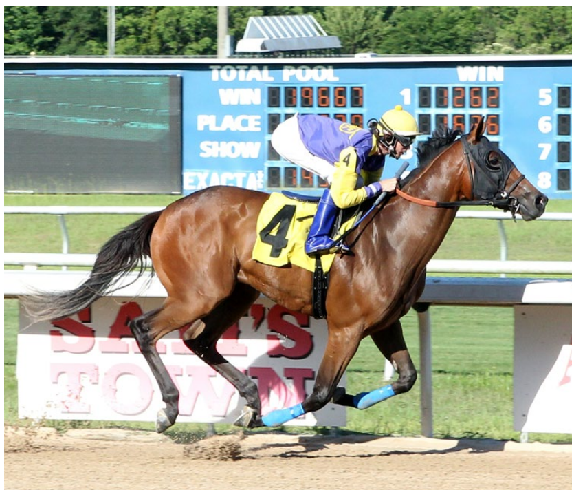
Pickett draws off to an easy win at Evangeline Downs