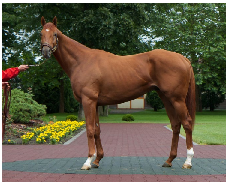
I'll Have Another stands at Big Red Farm in Japan

Godolphin's 3-year-old filly Mockery, winless after six tries, and longshot Charlonique, who will make her third start, round out the field. BH