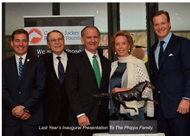
Last Year's Inaugural Presentation To The Phipps Family.