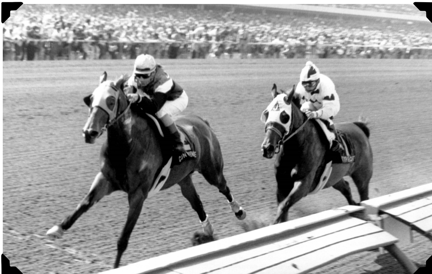
Convenience takes the lead in the match race at Hollywood Park