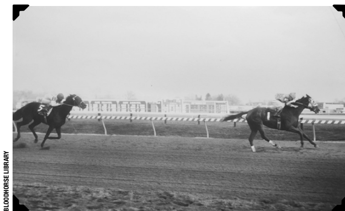
Gold Digger wins the 1965 Gallorette Stakes at Pimlico

To the cover of Raise a Native, Gold Digger foaled Mr. Prospector. BH