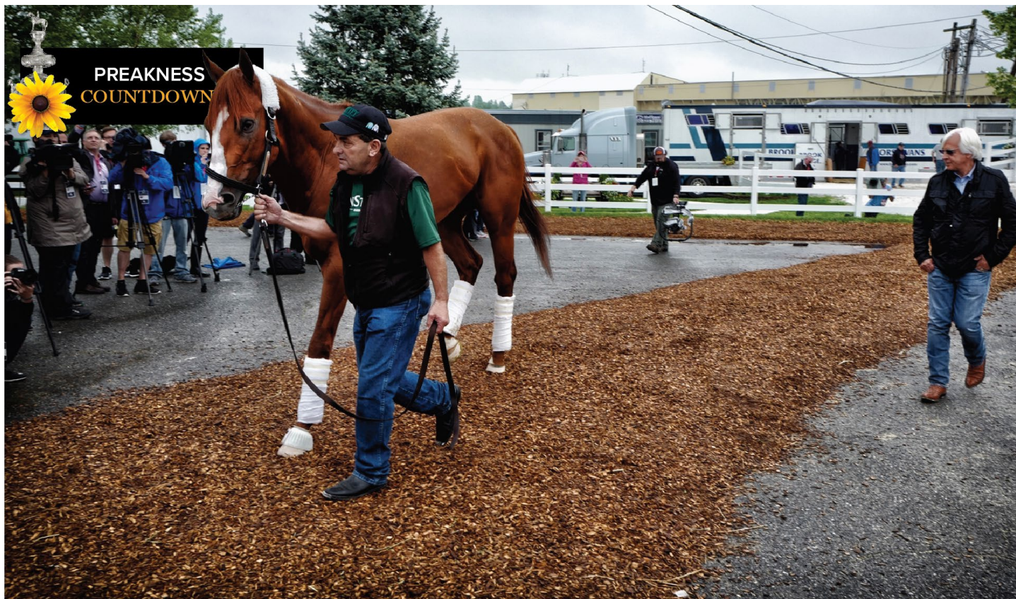
MARYLAND JOCKEY CLUB