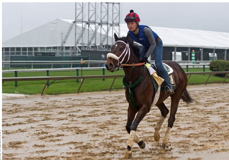
D. Wayne Lukas rides Starbuck the pony to accompany Sporting Chance at Pimlico Race Course