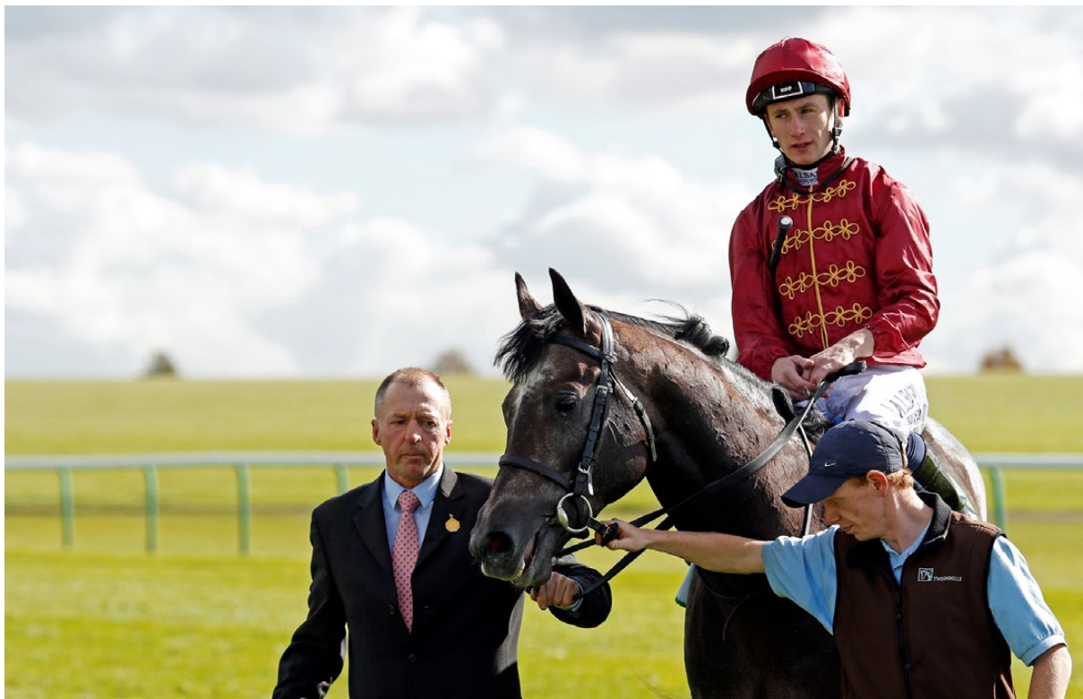
Roaring Lion after scoring in the Royal Lodge Stakes at Newmarket