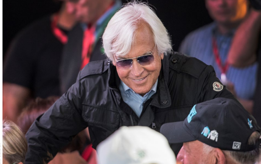
Hall of Fame trainer Bob Baffert reacts as Post 7 is assigned to Kentucky Derby winner Justify for the Preakness Stakes at Pimlico Race Course

The company around Justify is good enough that it won't merit a fiasco the level of the 1982 college football incident to get him beat this weekend, but it will take something extraordinary to knock