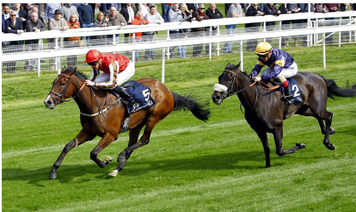
Give And Take gets by Dancing Brave Bear to win the Musidora at York