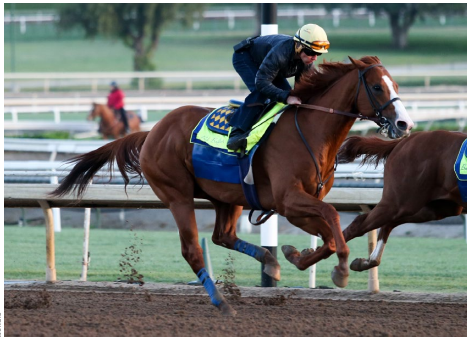
Justify works six furlongs in 1:13 flat at Santa Anita Park