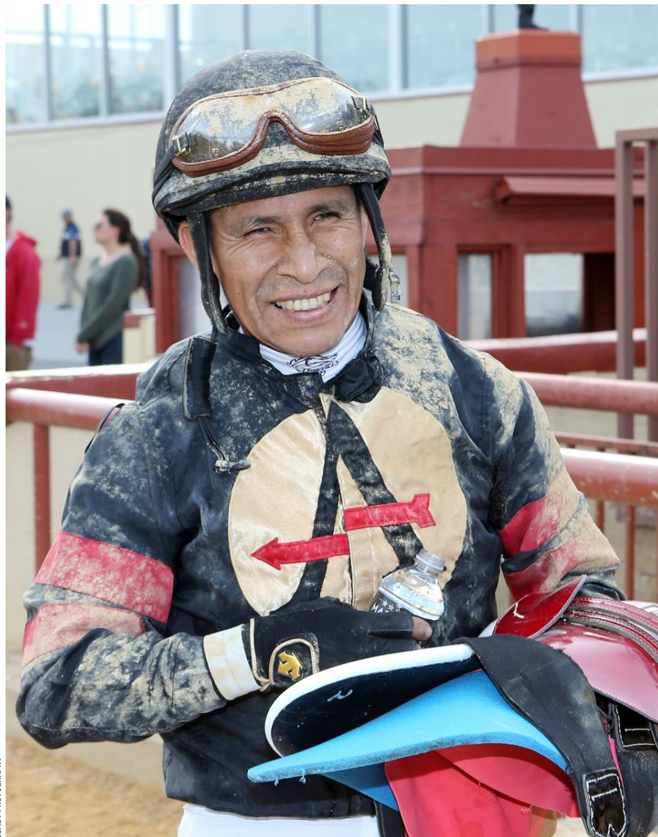
Hall of Famer Edgar Prado after his Charles Town Classic win at Charles Town Races

Something Awesome is out of the multiple graded stakes-winning Dance Floor mare Somethinaboutlaura, a California-bred whose exploits ranged from 5 1/2 furlongs to 1 1/16 miles. Awesome Again is the sire of several classic-distance performers, including three-time Charles Town Classic runner Game On Dude, who won the 2013 edition and ran