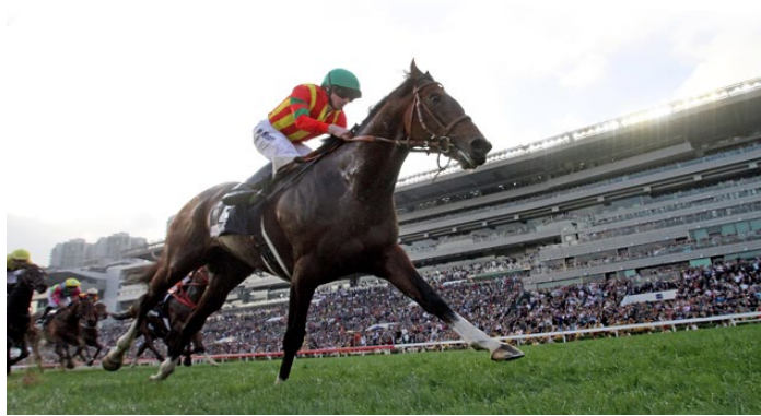
HONG KONG JOCKEY CLUB