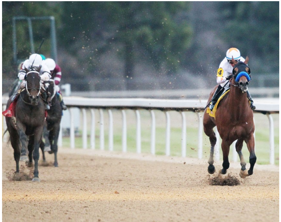
Mourinho captures the Smarty Jones Stakes in 1:37.25, the second-fastest time in the history of the race, which started in 2008

Mourinho, a son of 2010 Kentucky Derby Presented by Yum! Brands (G1) winner Super Saver, won his Sept. 30 maiden special weight debut at Santa Anita Park before finishing second there to Beautiful Shot in the six-furlong Speakeasy Stakes. He then finished second to Greyvitos at Del Mar in the seven-furlong