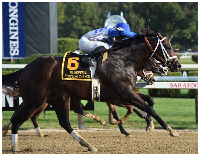
Sporting Chance takes the Sept. 4 Hopeful Stakes at Saratoga