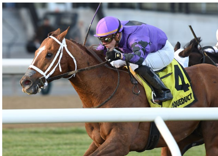
Rainbow Heir wins the Nov. 25 Aqueduct Turf Sprint Championship Stakes at Aqueduct Racetrack