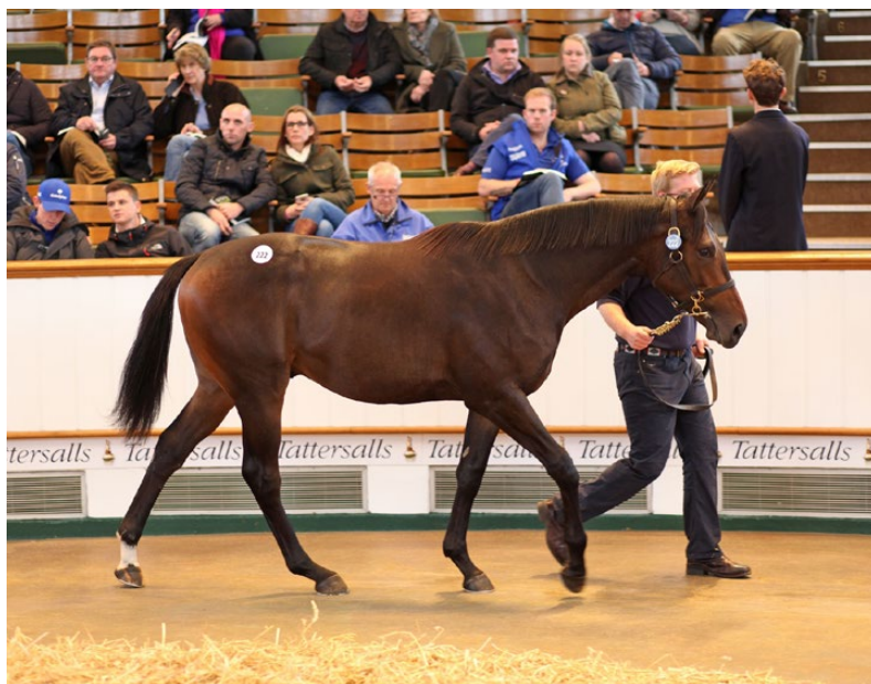
This Dubawi colt (Lot 222) topped the Oct. 4 session during Book 1 of the Tattersalls October yearling sale