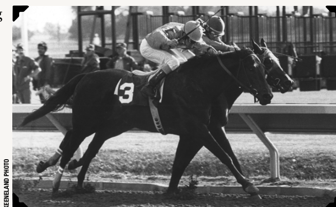
Swale (outside) wins the 1983 Breeders' Futurity at Keeneland