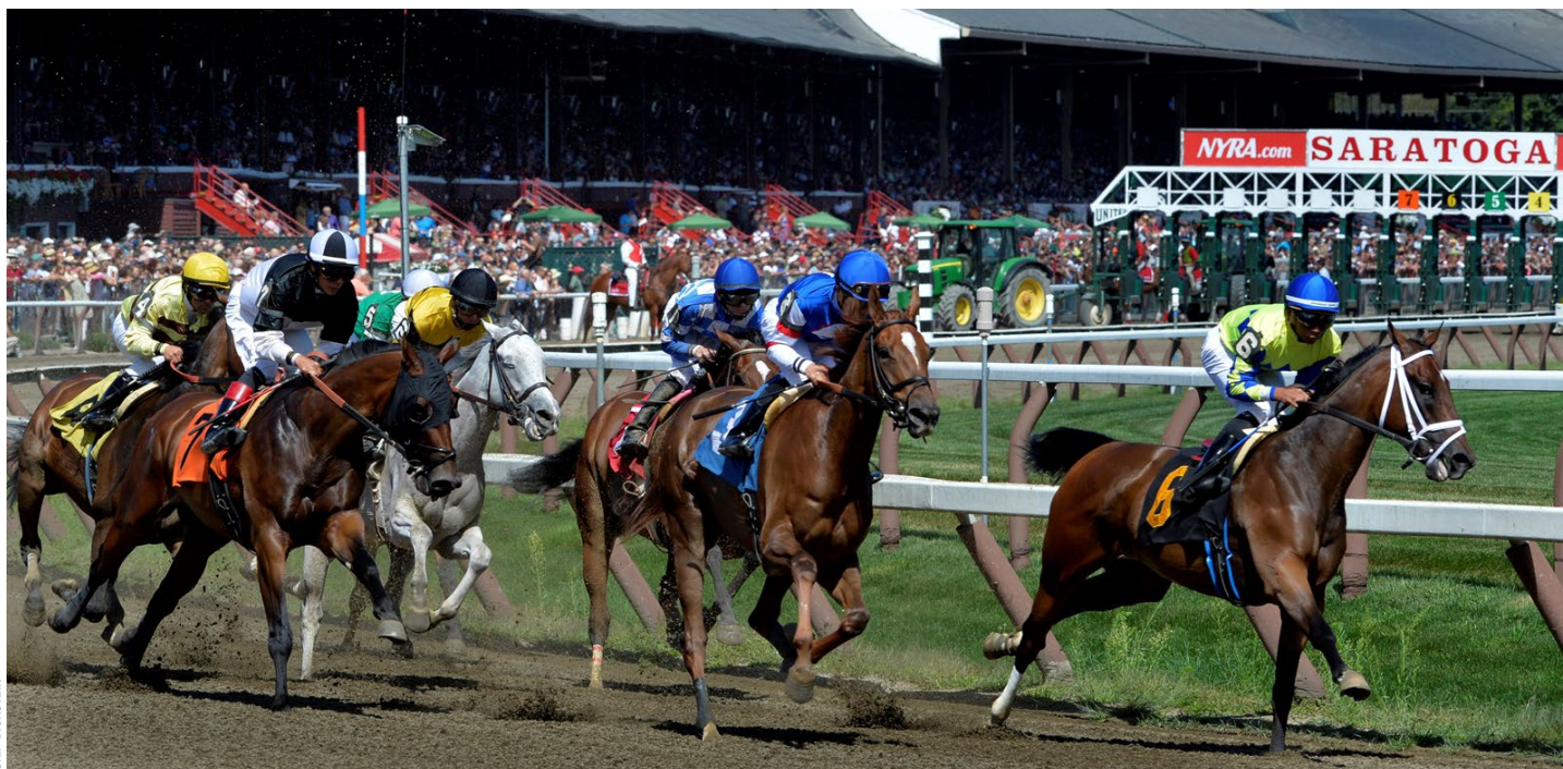
Summer racing produced gains in average daily handle, purses, and field size

* Includes worldwide commingled wagering on U.S. races.