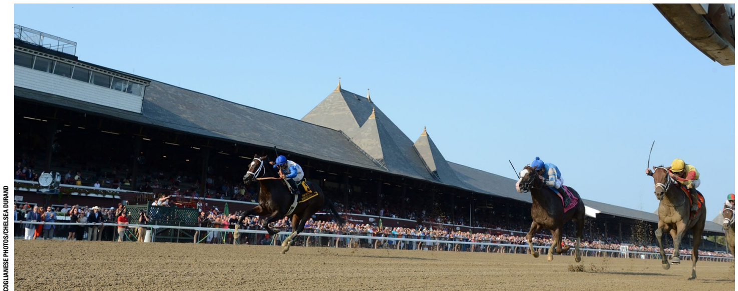
Sporting Chance wins the Hopeful Stakes after bolting to the center of the track at Saratoga Race Course

only graded winner under his first four dams. Sporting Chance is one of only three starters for Tiznow out of (continued on page 13)