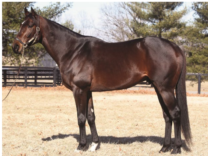
Practical Joke will join the Ashford Stud roster for 2018