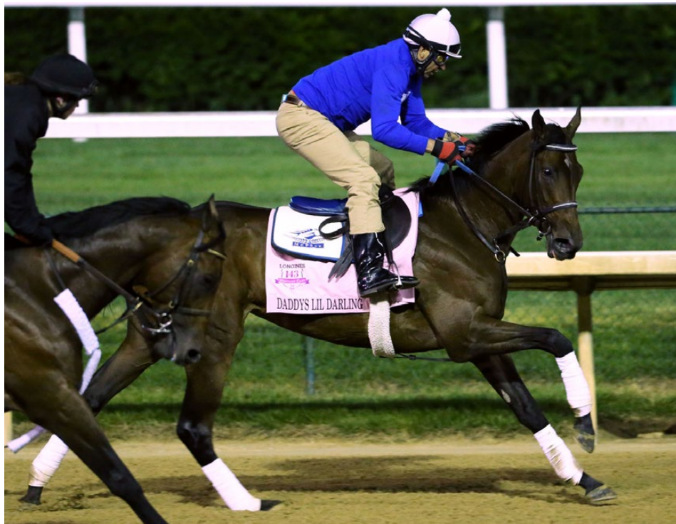
Daddy's Lil Darling, seen galloping at Churchill Downs before her second-place finish in the Kentucky Oaks, will run at Kentucky Downs this meet