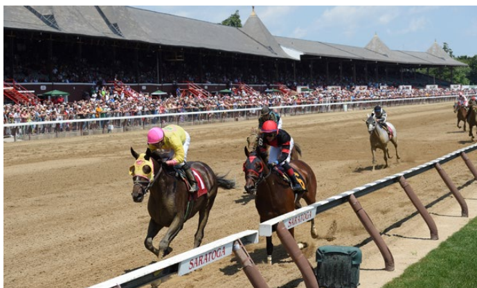
The running of the first race on Saratoga's opening day

Unlike all of the other myriads of betting pools on Saratoga's races (with the possible exception of the Grand Slam, the "boss's nephew" of betting pools), maximizing betting handle is not the primary objective of the late Pick 5. The purpose