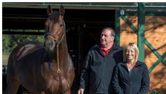
Treasure Beach at Pleasant Acres Stallions