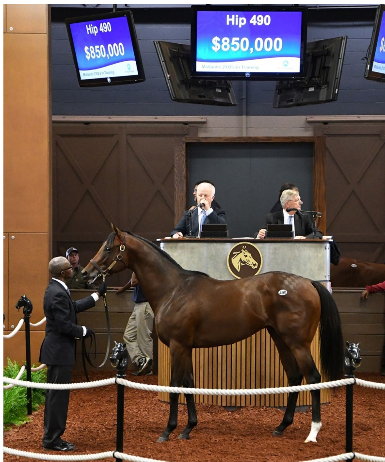
Hip 490, a half brother to grade 1 winner Lochte