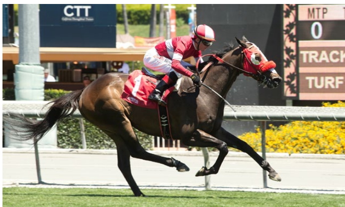
What a View picks up his front-running Crystal Water Stakes score