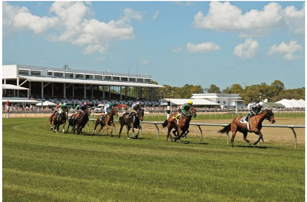
Racing at Tampa Bay Downs

Berube was also enthusiastic about bringing the new stakes to their racing program.